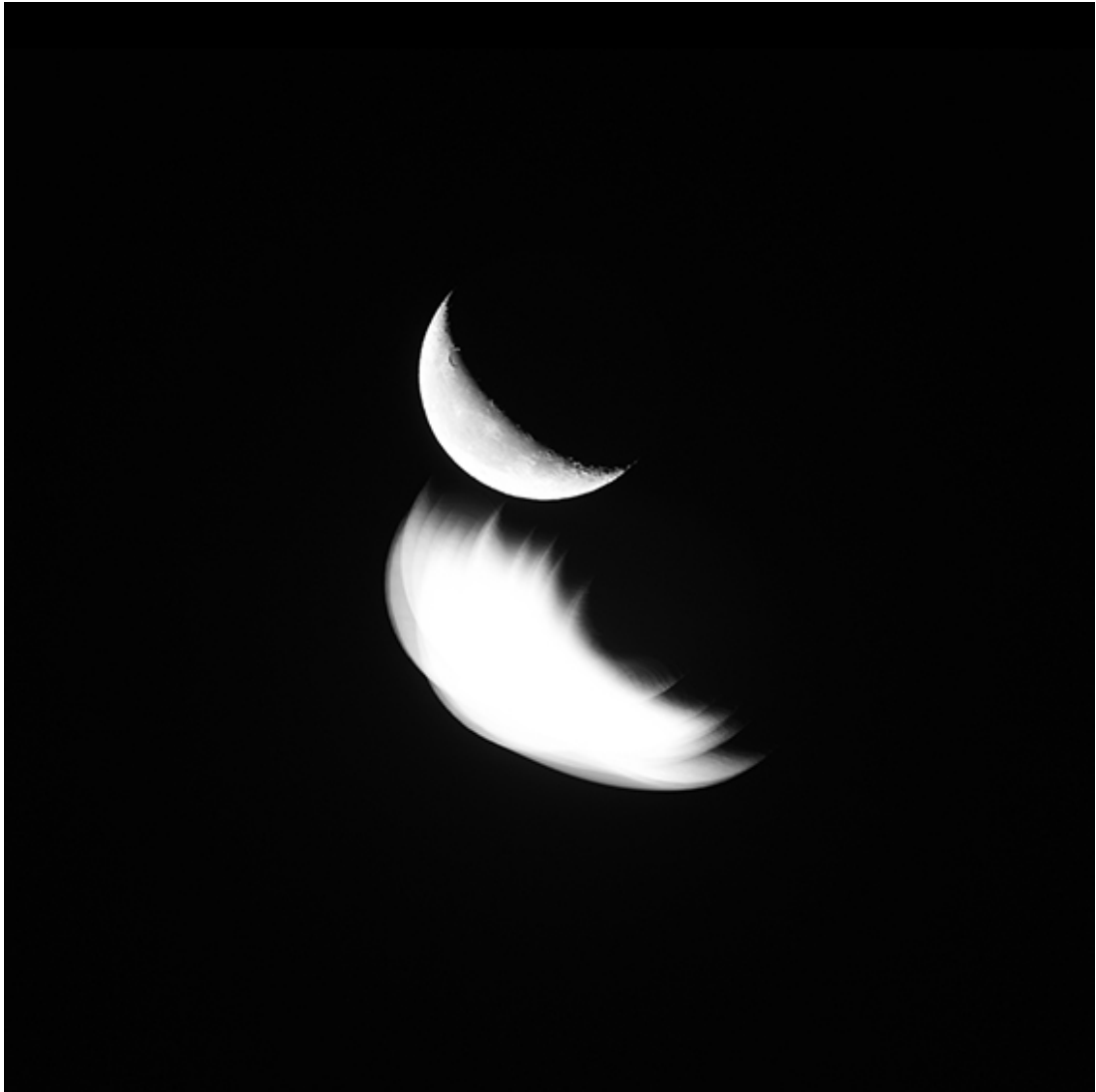
"Piuma di Luna_5109", 2017