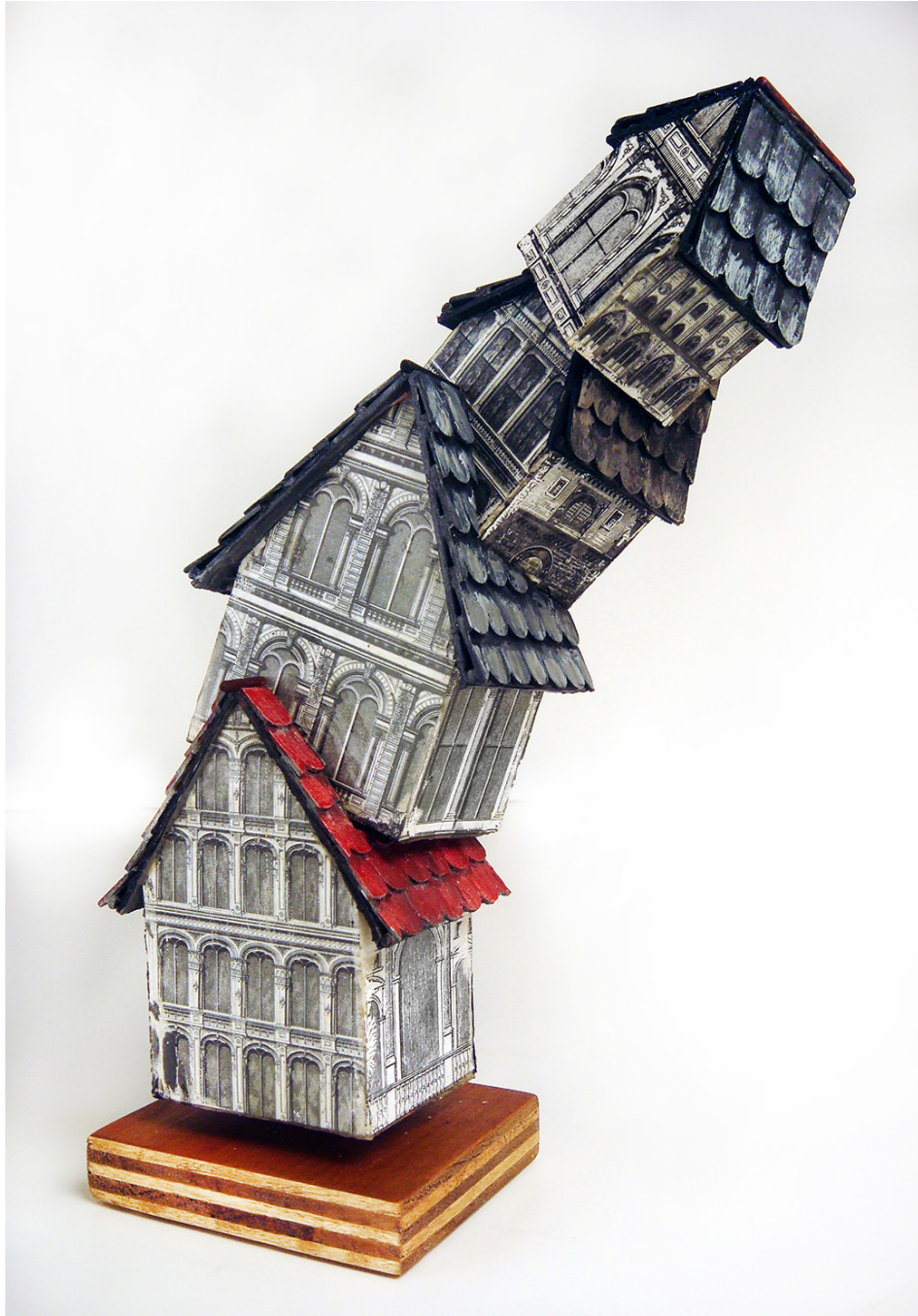
"Sleep Walker Tower, 2018