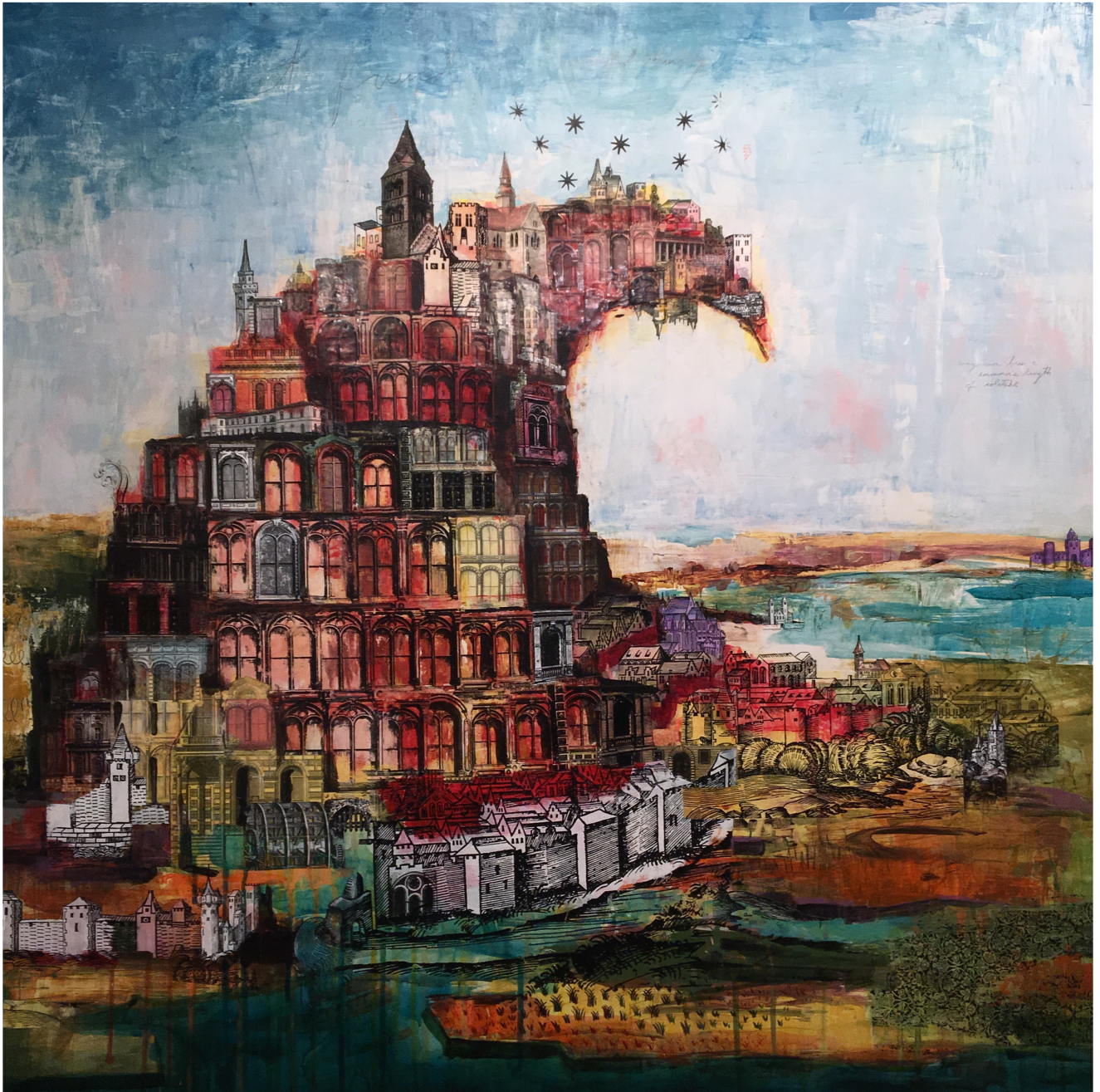
"Tower of the Twisted Hill", 2019