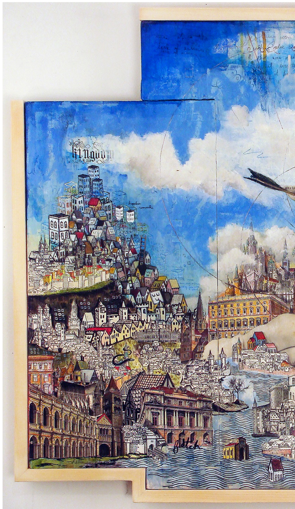
"Violence of Dreams", 2018