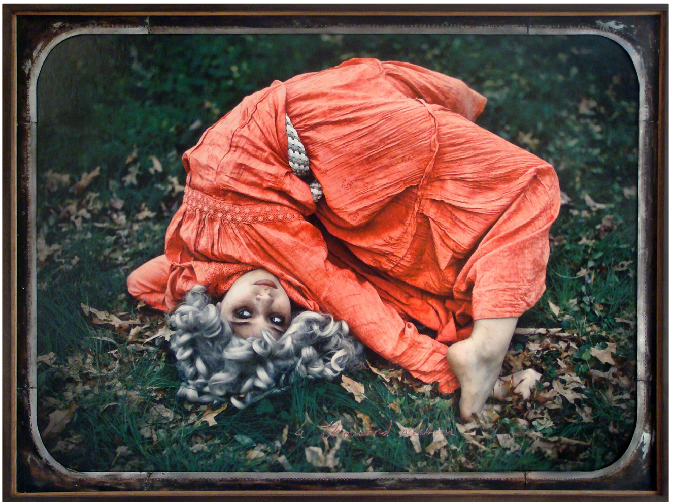
"A thousand seasons", 2018