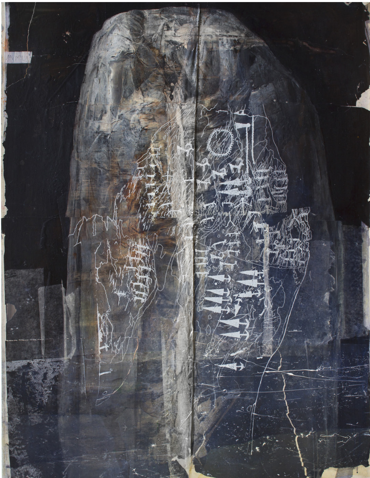
Anmla V, 2017