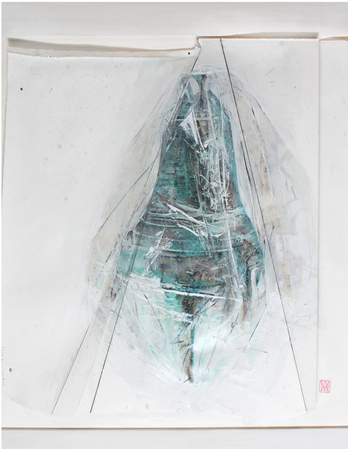
Neuma Calcos I , 2016