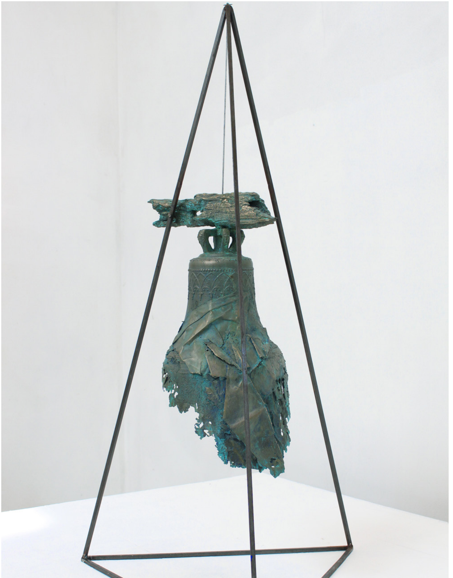
Neuma , 2017