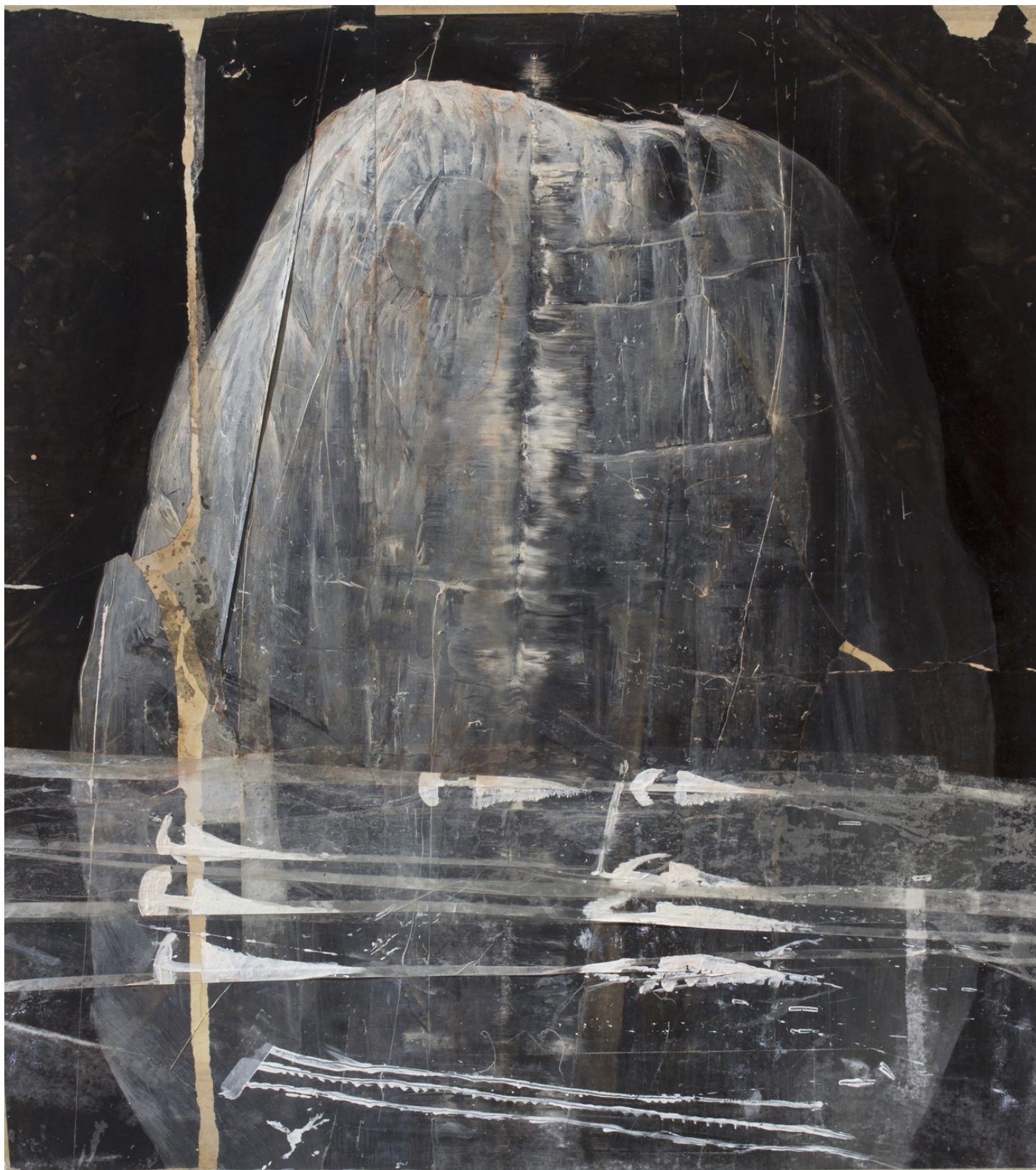
Anmla VI, 2017