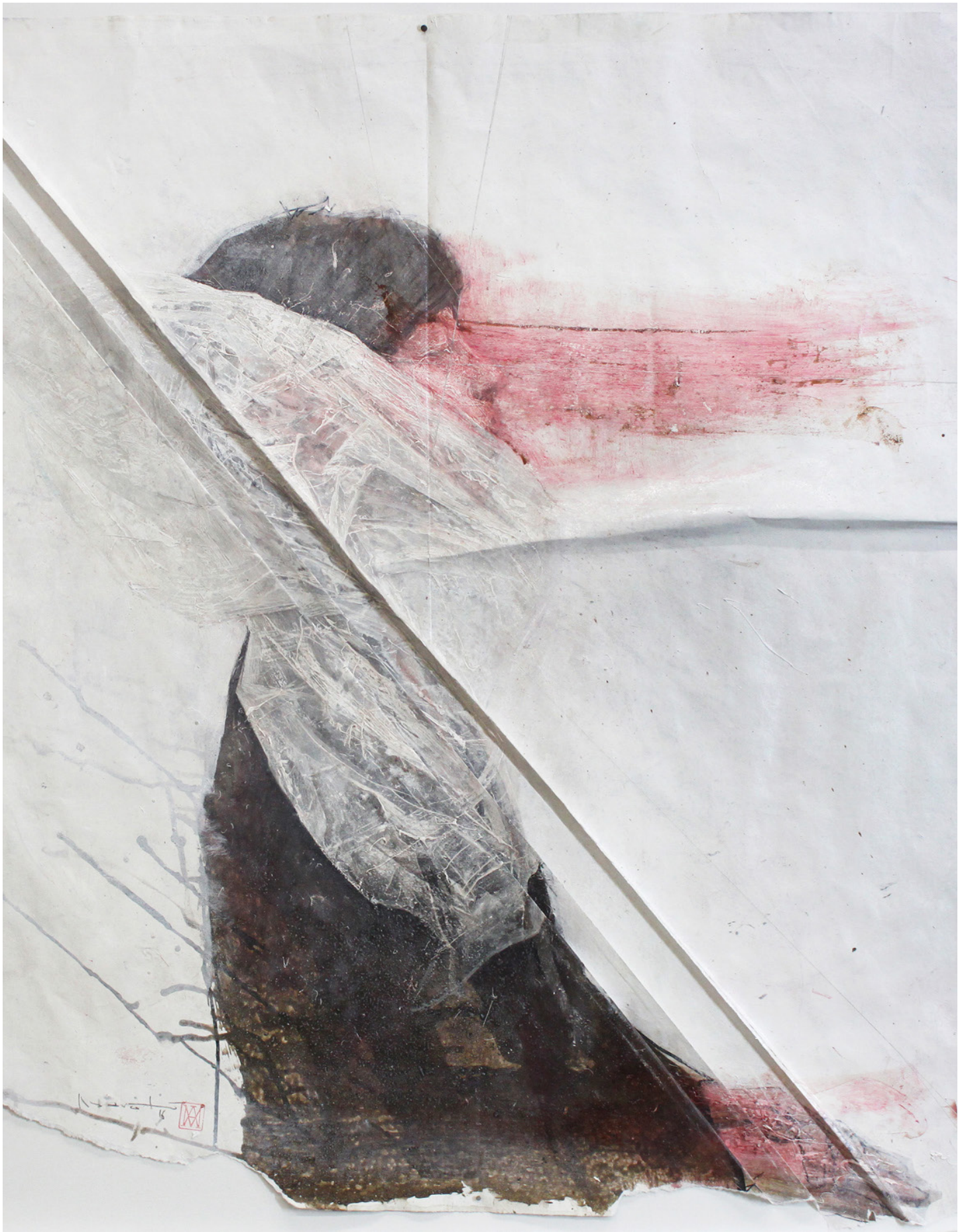
Konis Phito IV, 2016