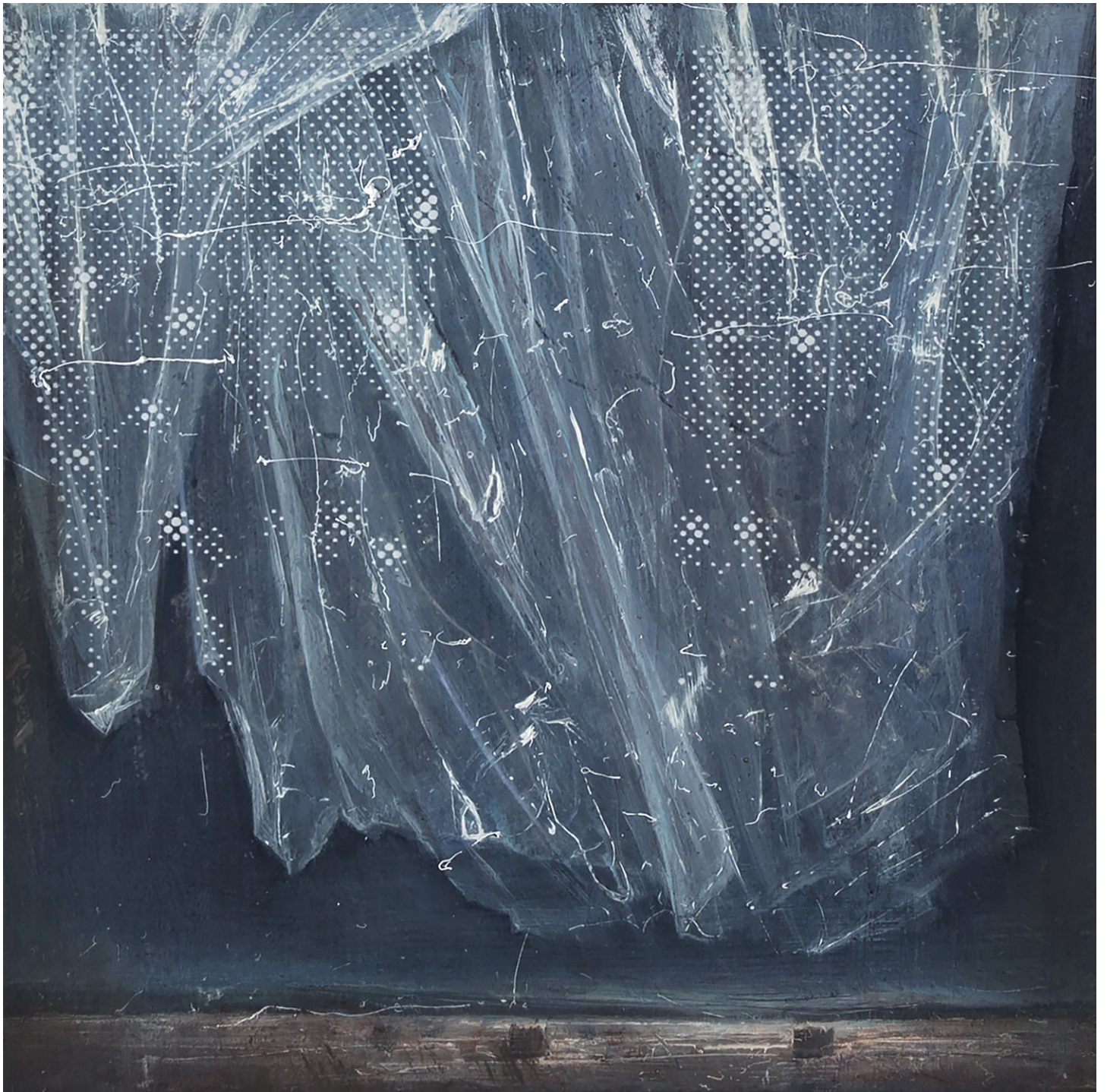
Aurora I , 2017